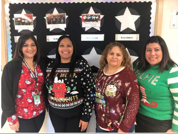
The ugly Christmas sweater contest was held on December 10.